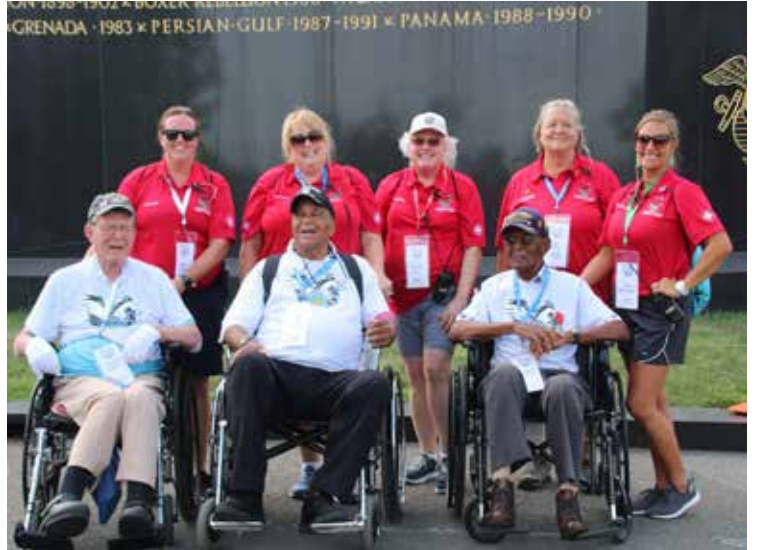
Volunteers from the Honor Flight Network greet Veterans as they step off the plane. Our Medical Team (shown above in red shirts) is comprised of nurses, doctors, and other medical professionals who take time out of their busy schedules to volunteer.