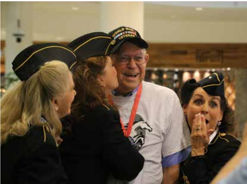
The Ladies for Liberty always bring a smile to the Veterans faces.

A guardian's sole mission is to take care of their Veteran.