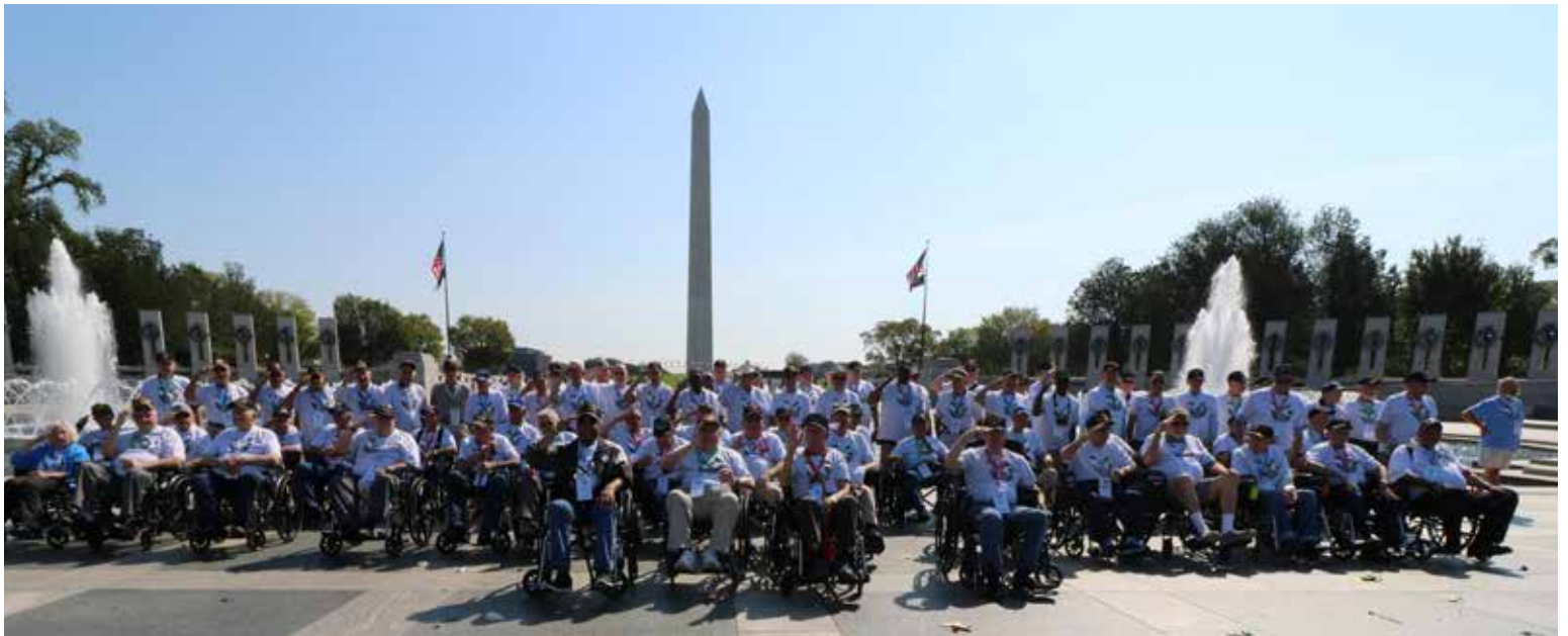
We flew 13 WWII Veterans, 32 Korean War Veterans, and 43 Vietnam War Veterans in September.