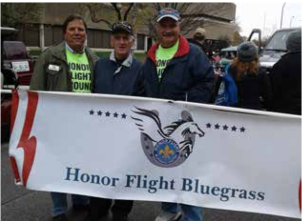
Participating in the Veteran's Day Parade