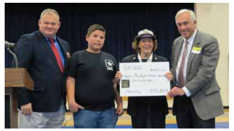
Hebron Middle School presents Honor Flight Bluegrass with a check