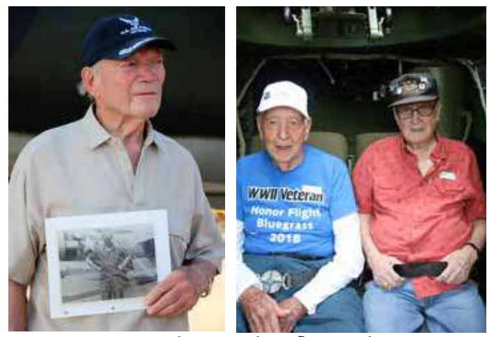
2,265 total Veterans have flown to date