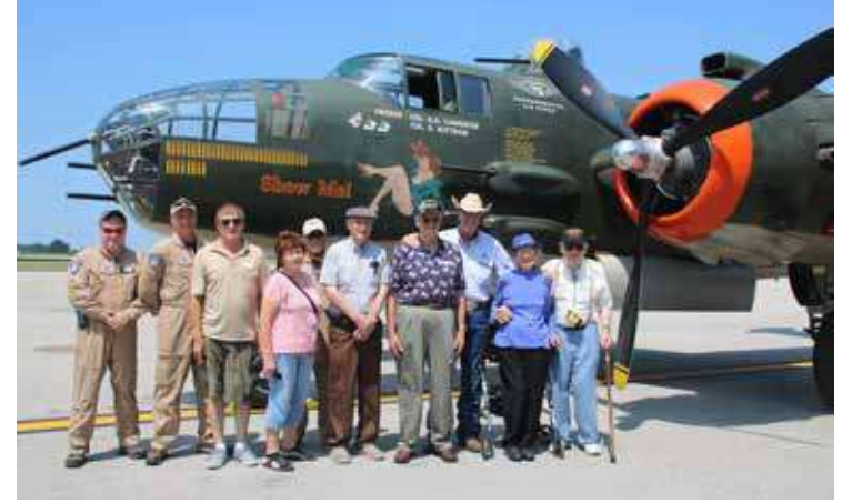
The B-25 Mitchell "Show Me" from St. Charles, MO visits Owensboro