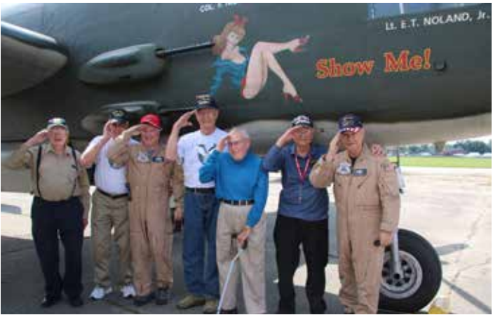
Bowman Field Aviation Festival